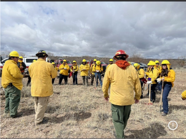
Cochiti VFD firefighters facilitating a After Action review (AAR) after assisting on Cochiti Pueblo’s ag burn.

In 2023, the Cochiti Wildfire Risk Reduction plan was implemented. The intent of this plan was to educate the public on safe practices during seasonal agricultural burns, provide firefighter training, and promote multi-agency cooperation. This program was deemed successful resulting in over 200 acres of agricultural fields safely and successfully treated for the growing season. In addition, 20+ firefighters and farmers received hands on training in a controlled environment. The success of this plan lays with the implementation of the CFD Wildland Coordinator. Cochiti firefighters participated in approximately 1500 hours of collective training in the 2023 season. This training was held not just in our stations but at different locations throughout the state.