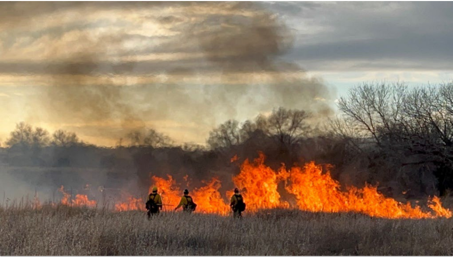
Cochiti VFD Bearhead Hand Crew assisting on a agricultural burn on Cochiti Pueblo.