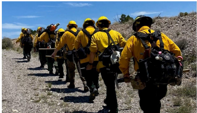
Cochiti Lake Fire Volunteer Department's Bearhead Hand Crew Module on a recent preseason training hike.

The VFA grant has been instrumental in creating a successful system by increasing out capacity within our region. This grant has helped the Cochiti Fire Department's Bearhead Fire Crew by providing much needed personal protective equipment, shelters, weather monitoring equipment, equipment handles, and fire hose. This equipment has helped us build capability by allowing us to provide for safety, not only to our firefighters, but to our communities and landscapes that we protect. The increasing effectiveness that this equipment has given the Cochiti Fire Department has also helped our surrounding communities and partners by allowing us to lend a helping hand in an emergency.